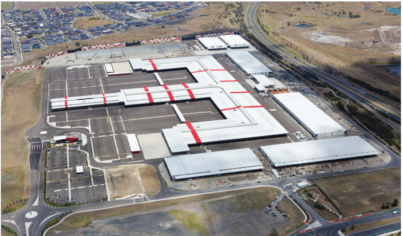
Aerial photo of the new Market at Epping, taken 30 January 2015

Keep an eye out for the updates from market officers, and in the cafés. The information will also be available to you on the new 'stand holder' page on the MMA website.